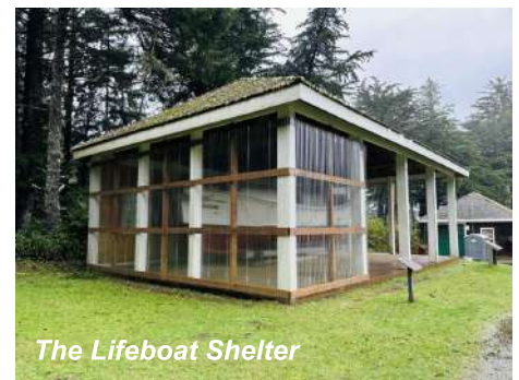
The Lifeboat Shelter

Lastly, we would like to express our gratitude to Oregon State Parks for providing a shelter to house Lifeboat No. 36498 just in time for the Winter season. A lot of work went into repainting the lifeboat last summer, and the effort that went into protecting the boat from the unusually harsh winter storm season is greatly appreciated. ❄️