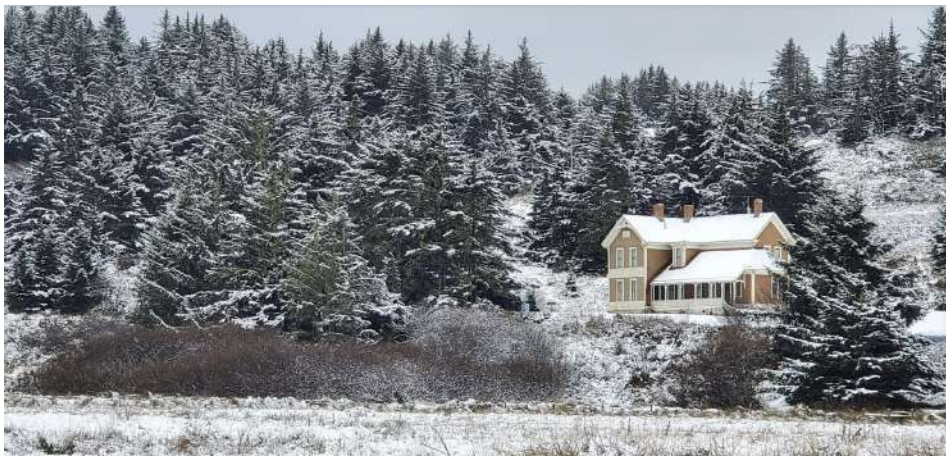
The Hughes House looking pretty as a postcard during an unprecedented coastal snow event in 2023.

The Cape Blanco Lighthouse will open on May 1 2023 this year instead of its traditional opening day of April 1. This decision was reached by the board members of the Cape Blanco Heritage Society (CBHS) due to problems related to the short road from the lighthouse gate to the lighthouse. This road has experienced considerable damage over time and the seasonal rains and unusual snowfall of this Winter has taken additional toll on the road. The damage has led to the closure of the road to all vehicles, including visitors, staff and volunteers.