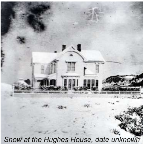
Snow at the Hughes House, date unknown

We are working with the family to identify many of the people in these photographs as well as creating a map of the buildings of the ranch as seen in the era represented. Prints of the full collection will be on display at the Hughes House as an exhibit in 2025. ❄️