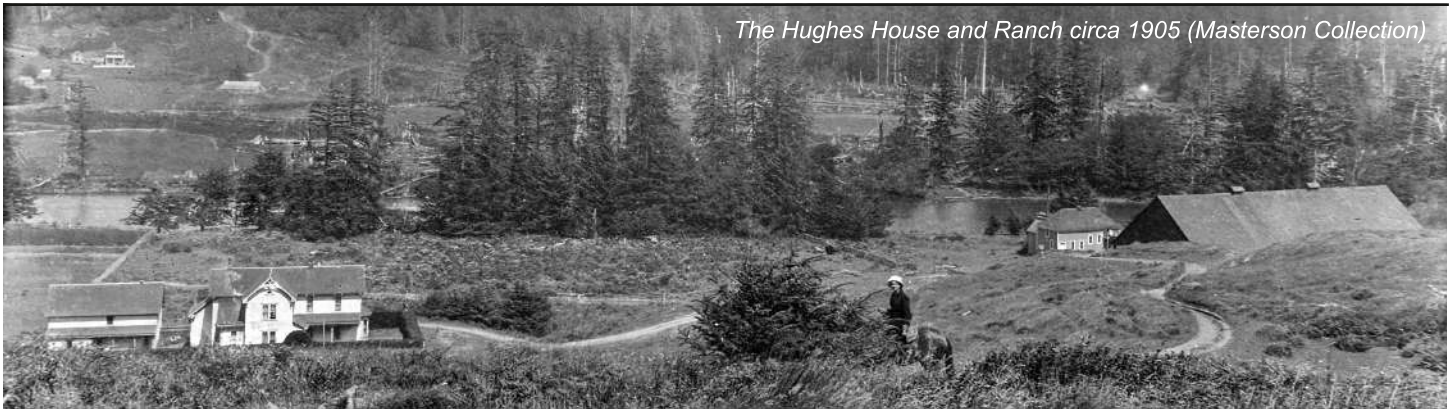
The Hughes House and Ranch circa 1905