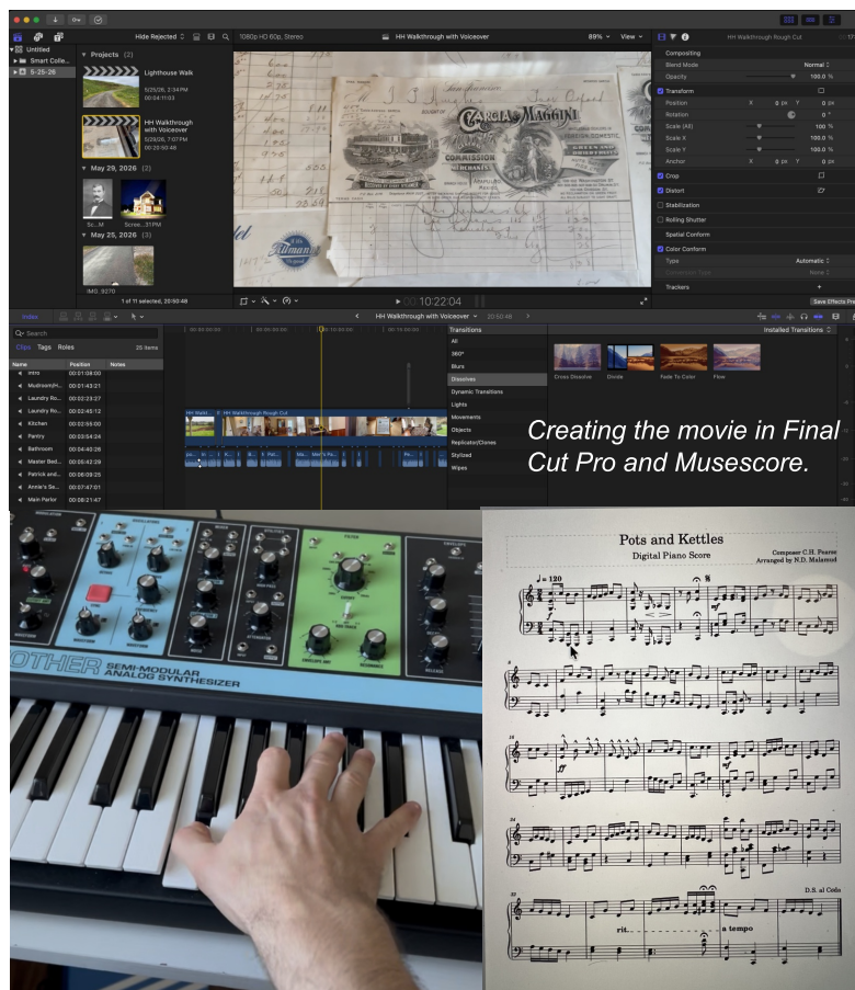
Creating the movie in Final Cut Pro and Musescore.